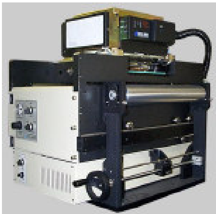
Wide Web EBI

Print Resolution: 240 and 300 dpi per inch (operator selectable)